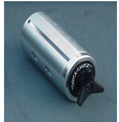
The new Quick Chuck Model C-76170 for 76 mm cores is pictured here.

Warranty: Limited 3-year Parts and Labour Warranty.