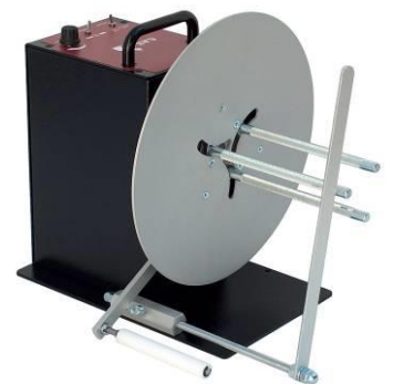
CAT-3-TA-ACH with APG

CAT-3-TA Rewinder to be simply set in place. Special anti-slip feet keep the unit from moving. The CAT-3 handles any rewind job and with its "HIGH" torque range can also power the LABELMATE S-100 or S-200 Label Slitters. Reliable, high quality and maintenance-free.