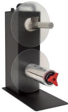
TWIN-CAT-2 Standard / C-76170

LABELMATE's Dual-Spindle Heavy Duty Unwinder / Rewinder, the TWIN-CAT-2 has two powerful motors and your choice of core holders. You therefore have maximum versatility in setting up the operation you need. Both spindles can rewind and unwind. You control the direction and torque on each spindle independently. An External Halt Control allows you to STOP and START the TWIN-CAT-2 with a foot switch or other external device if desired. A worldwide universal switching power supply is included.